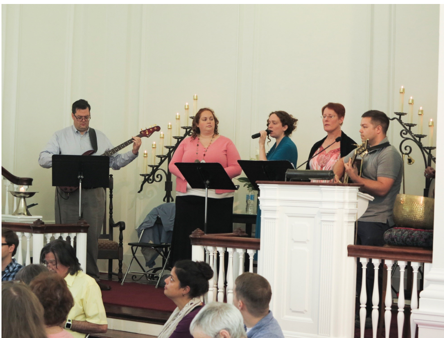
The Early Morning Risers at the Annual Concert on May 15th.

(With apologies and thanks to Macalester College recruitment brochure)